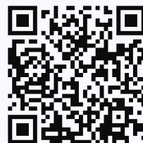
This Book, AMAZON CANADA