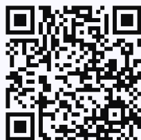
This Book, AMAZON US