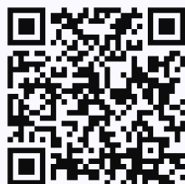
This Book, AMAZON US