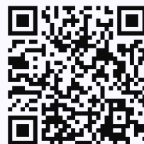
This Book, AMAZON CANADA